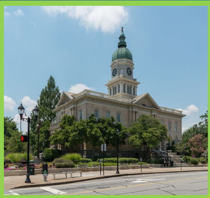
Citizens of ACC